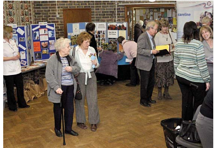
Public Information Day at North Mundham Hall

Rural community buildings come in all shapes, ages and sizes. However, one thing common to them all is that they are essential for the vitality and vibrancy of community life. In most cases we are talking about a village hall, but we could also be talking about a community owned shop, the church hall, a community owned 'pub', a converted school building or classroom, or community office. In many Sussex villages there is only one meeting place. If this closes or deteriorates to the point that it can no longer be used, the community itself begins to die. People are forced to go elsewhere for clubs, organisations and services and the loss of a local meeting place means that vulnerable people become increasingly isolated and invisible. Even in these days of instant communications, community buildings remain essential for social and community networking as well as for the delivery of local services and facilities.