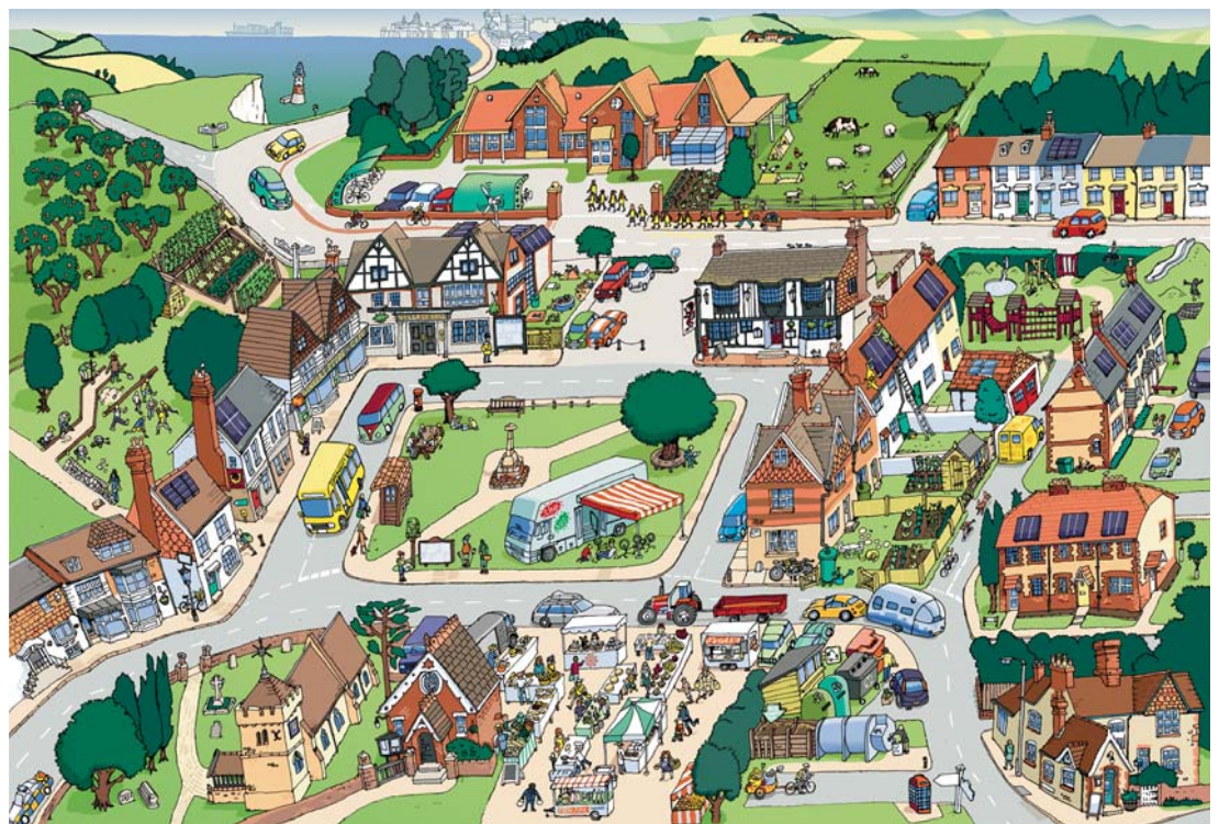
Above: AirS 21st Century Village illustration