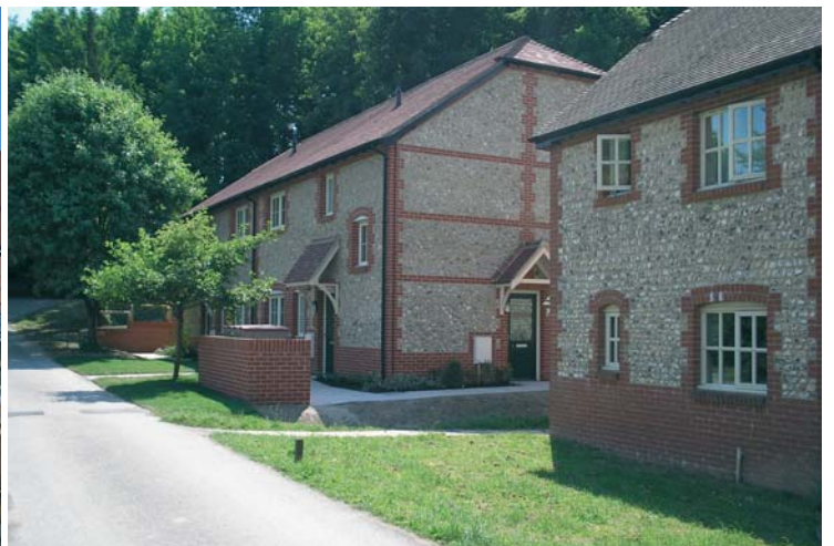
Above: new housing scheme at Barcombe Right: affordable housing at West Dean, West Sussex