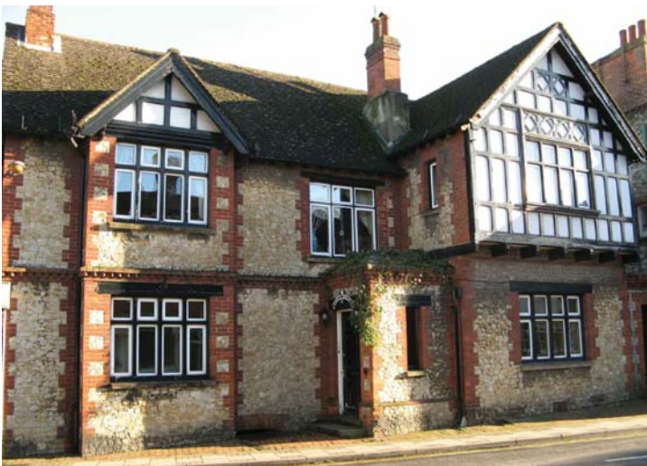
Above: Storrington Forge House Community Hub

Accessing services is a significant factor that affects the daily lives of many people living in rural areas. Whether it is travelling to hospital, getting advice on the telephone or seeking information on the internet, a wide range of barriers can prevent people from carrying out simple everyday tasks. Whilst many would accept that by living in the countryside, the ease with which they can access certain services and facilities is likely to be lower than those living in towns and cities, the experience of many people in rural areas is that this situation has become worse.