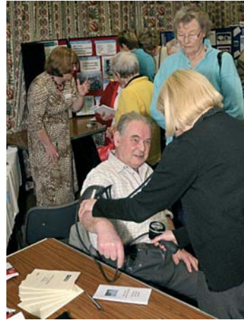
Health services at North Mundham Hall

In both Counties the needs of rural older people for support services should be met regardless of where people live. The cost of providing this is likely to increase as the numbers rise and the danger is that some services are cut back to the detriment of rural areas. Key issues of concern for older people are access to schemes that help them to keep healthy and active, health and hospital services, access to local shops, affordable, warm and appropriate housing, see fuel poverty on page 9 , and the ability to socialise and participate in community activities and events. Targeted and appropriate support within the local community can help particularly in preventing a deterioration in the mental and physical health of individuals through the development of strong community based support services, operating from the Village Hall or provided locally, that will enable older people to continue to socialise, remain healthy and to stay in their own homes for as long as possible.